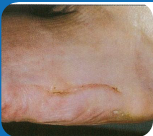
Pains and edema are alleviated after the first aid and PRP injection