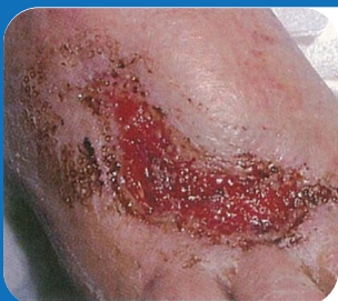
c. Spray PRP before the wounded part is covered with Opsite dressing (Smith & Nephew)