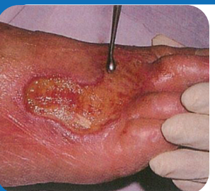
d. Wrap a bandage around the wounded part to prevent contamination.