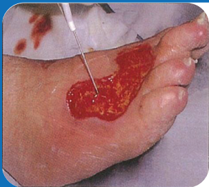
Case A : Diabetic Foot Ulcer