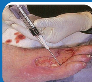
4 weeks after PRP treatment