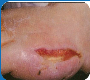
Case B : Diabetic Foot Ulcer