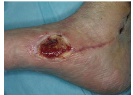
Diabetic Foot Ulcer