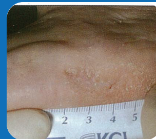
6 weeks after PRP treatment