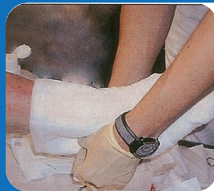
a. Eliminate the necrosed tissues.