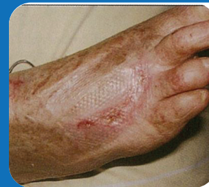
b. Inject or spray PRP on the wounded parts to accelerate wound healing and avoid cutting off the foot.